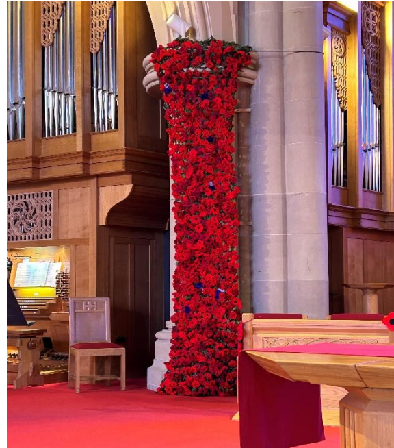
Final installation and image used by L&W, Jan 2024