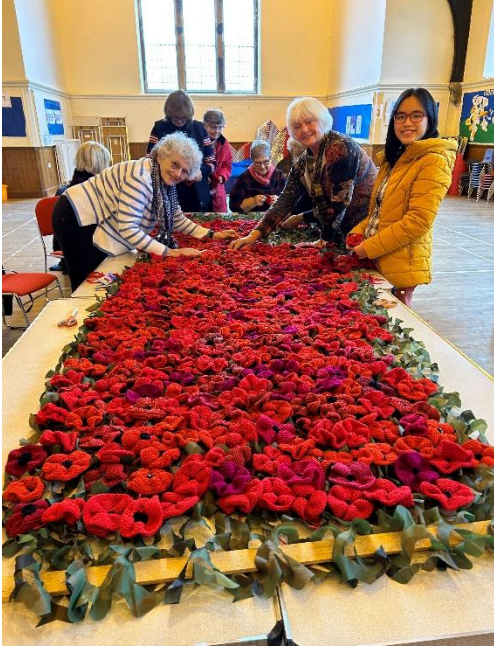
Project coming together, October 2023

The installation was created by the Women's Group, Flower Committee, members and friends of Sherbrooke Mossspark Parish Church and Ibrox Parish Church.